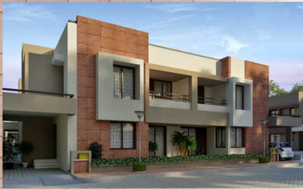
TYPE - A Plot No. : 11 to 14 & 62 to 77